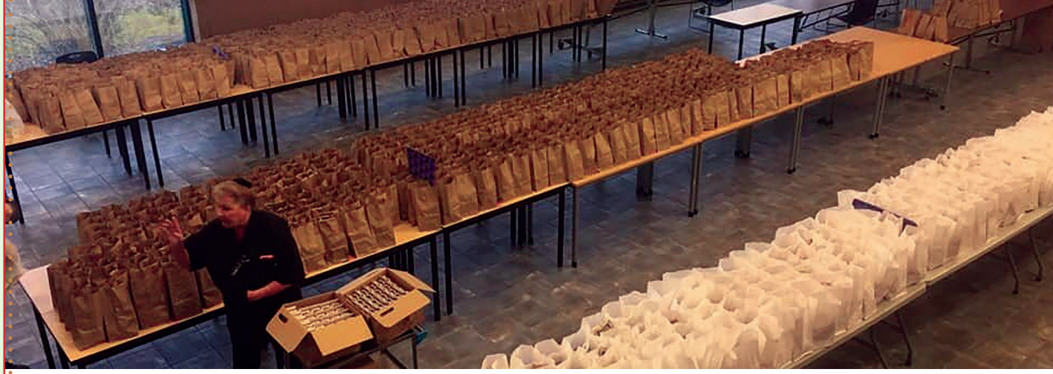
Gearing up for four days' worth of meals distribution.

By Suzanna Caldwell, Solid Waste Services , Municipality of Anchorage