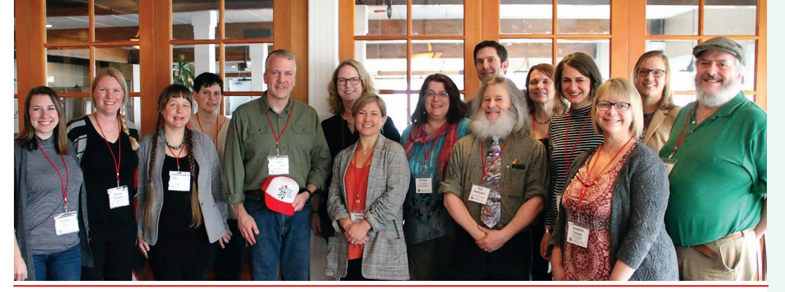
Board members with Senator Dan Sullivan, taken during the 2019 semi-annual conference